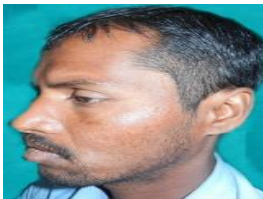
Fig. 1.C. Absence of lesion on left side of face