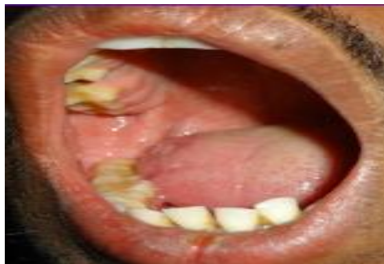
Fig. 4. A, B : Post-treatment follow up uneventful.