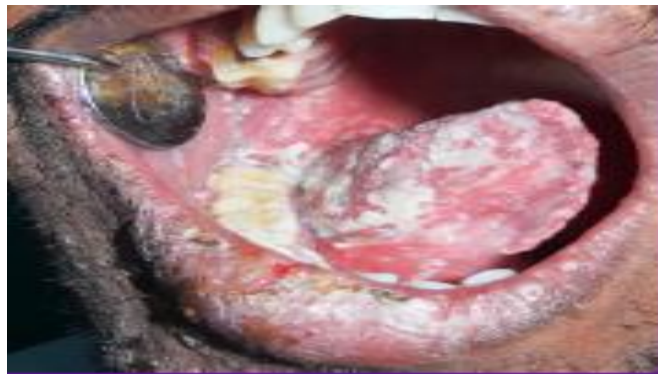
Fig. 2. A, B : White coating and erosive areas on tongue extending from tip to anterior faucial pillars and from midline to the lateral border of tongue involving ventral surface and floor of mouth .Unilateral palatal erythema