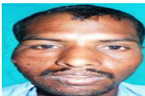
Fig. 1.A. Unilateral involvement of right face. Periorbital oedema with right eye